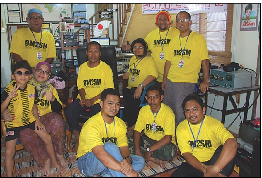
The operating team and club members of multi-single entry 9M2SM from Malaysia.