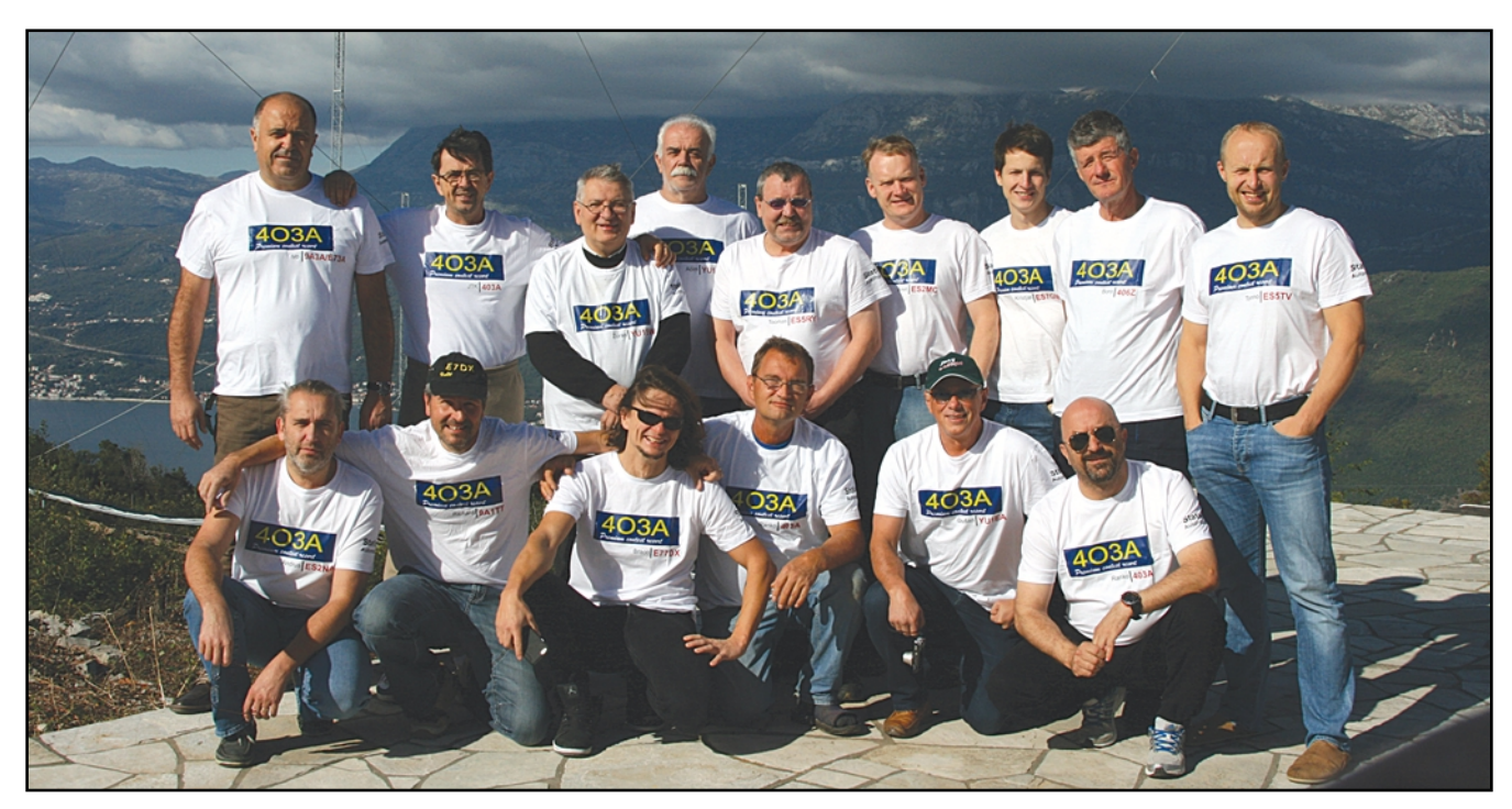
The operating team at Multi-Single entry 403A from the Republic of Montenegro. Back row: 9A3A, 403A, YU1EW, YU1YV, ES5RY, ES2MC, ES7GM, 406Z, ES5TV. Front Row: ES2NA, 9A1TT, E77DX, E77W, YU1EA, 404A

Andre, DL4UNY, operating the 160-meter band at Multi-Multi DF0HQ.