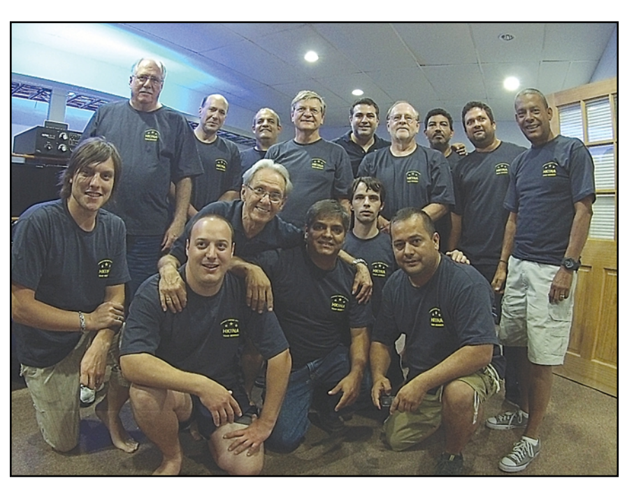
The operators of Multi-Multi HK1NA in Colombia. Standing: K1MM, KM3T, HK1R, K1CC, LW1DTZ, K1XX, HJ1FAR, HK1T, AD4Z. Front: LU9ESD, LU8EOT, HK3TK, HK1X, LW9EOC, HK6F