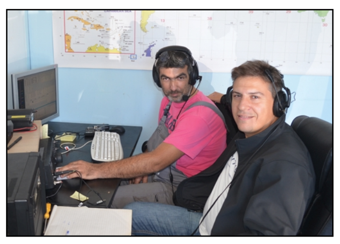
SY1BCL and SY1ALH participated in their first contest from SZ1A.